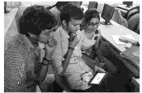
them a unique experience of attending a quiz competition on Akaash Tablets.

challenge the fellow students on C language. The participants of the quiz used the "Clicker" software provided by IIT-Bombay on the Akaash Tablets. The quiz was conducted in two rounds. First round was elimination round and second was the final round. 26 teams registered from CSE and IT department. This quiz, organized on 11th September 2013, provided an opportunity for students to expand their knowledge in C and gave